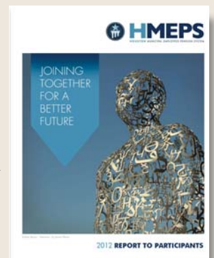
2012 Report to Participants

If you did not receive your statement(s) and Report, please call the HMEPS office.